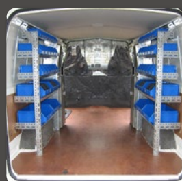
Van Rack Kit