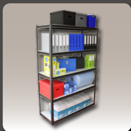
Z Beam Shelving