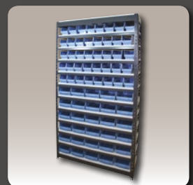
Rivet Bin Shelving