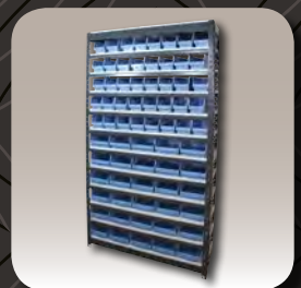
Rivet Bin Shelving