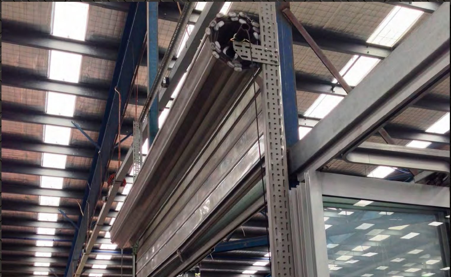
Roller Shutter Doors