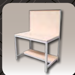
Handy Angle Work Bench