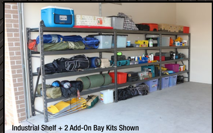
Industrial Shelf + 2 Add-On Bay Kits Shown