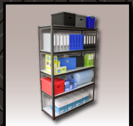
Z Beam Shelving