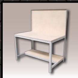
Handy Angle Workbench