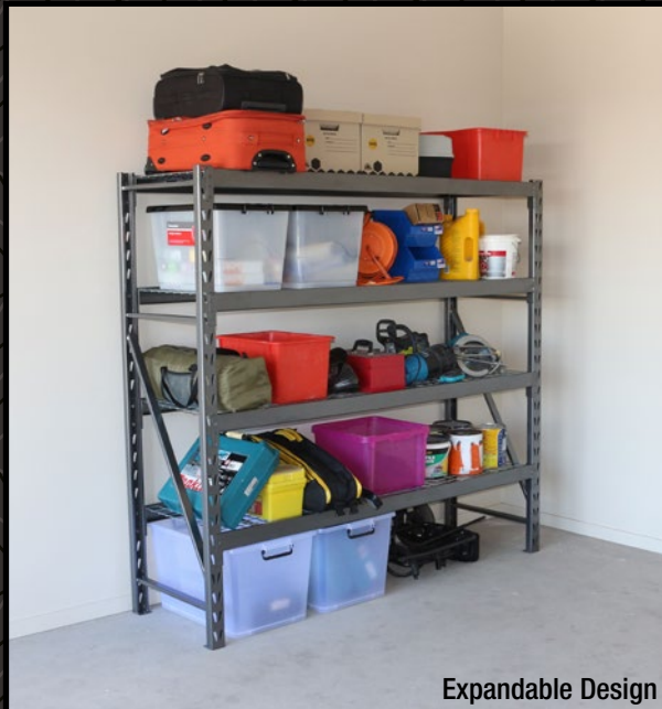
Expandable Design ● ● ●